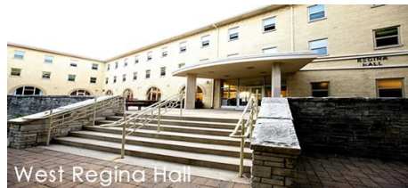
West Regina Hall