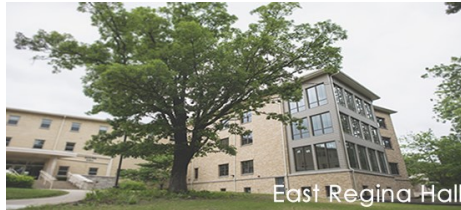
East Regina Hall